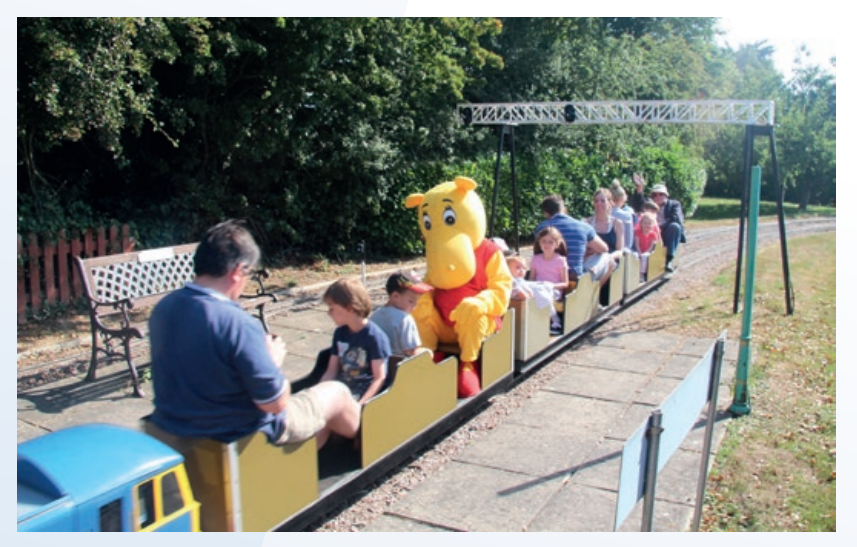
Above: a lovely sunny day during one of our busy Thursday mornings at the Parklands Miniature Railway during the school holidays. Left: one of our bungalows in the B Terms range, in a very sunny position.