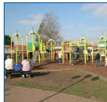
Children's Adventure play area.

Prices: Offer 1 £95, Offer 2, £105. Prices include gas and electricity. Short-stay holidays during June or July are sometimes possible prices on request.